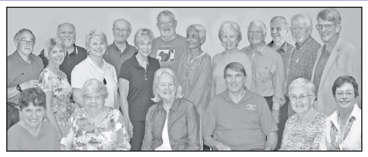
The OLLI Board of Directors 2014—2015