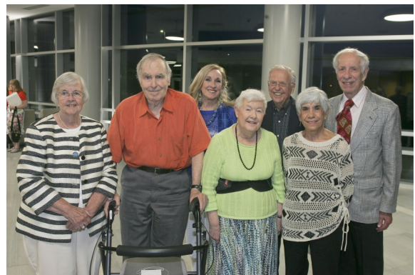
Instructors Who Taught 25+ Courses