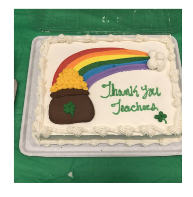
St. Patrick's themed cake